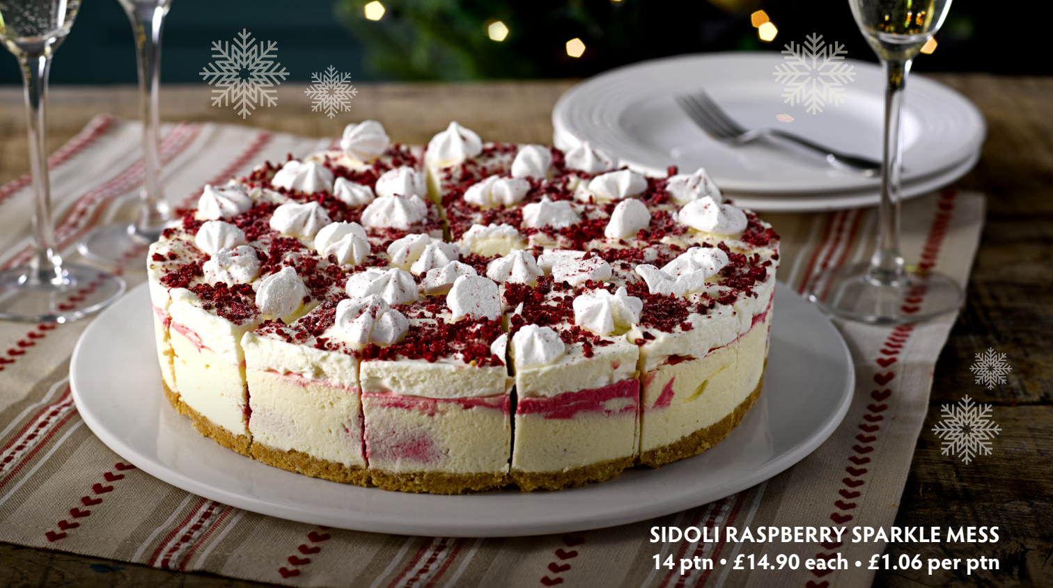
SIDOLI RASPBERRY SPARKLE MESS 14 ptn • £14.90 each • £1.06 per ptn