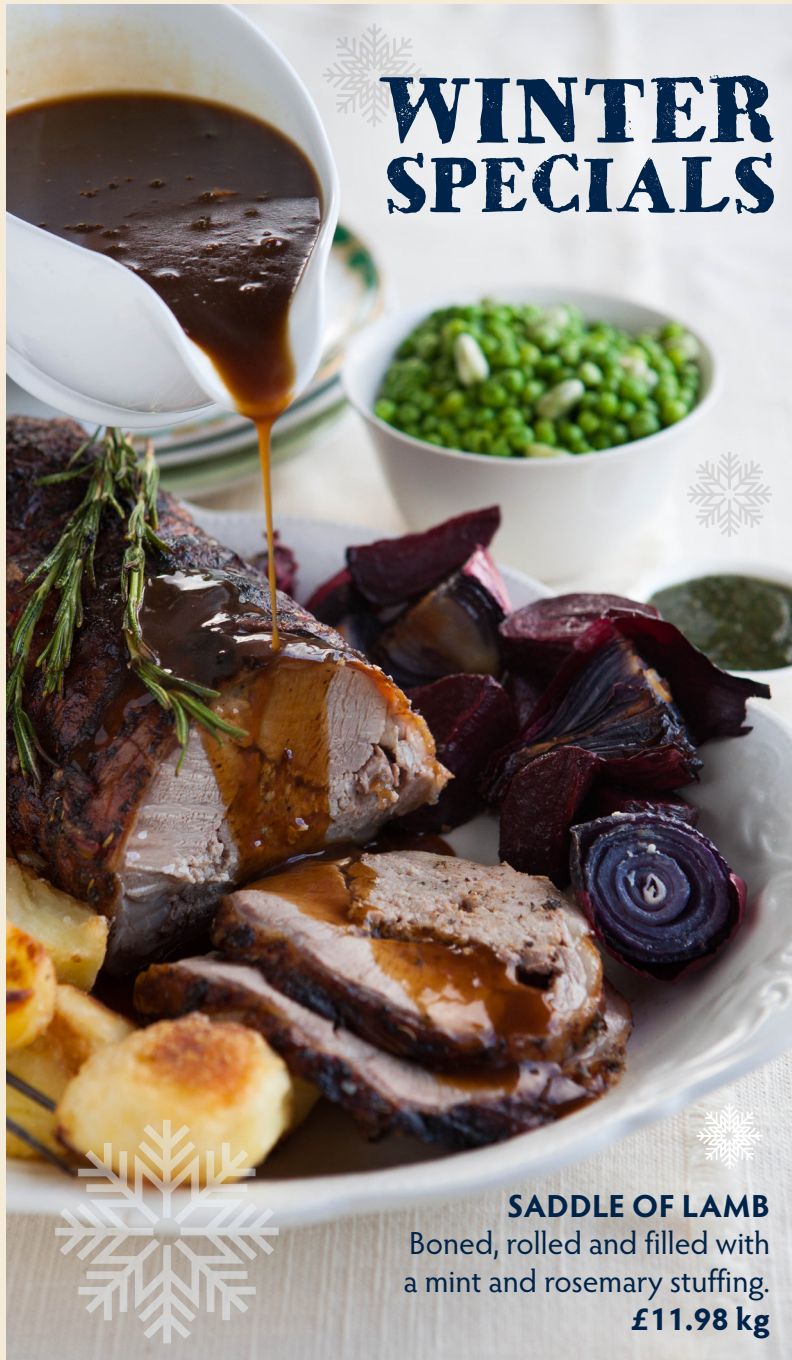
SADDLE OF LAMB Boned, rolled and filled with a mint and rosemary stuffing. £11.98 kg